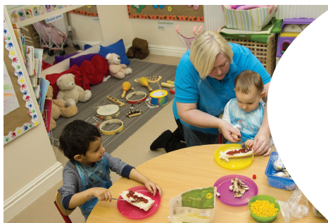
STN Birmingham, West Midlands