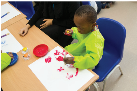
STN Birmingham, West Midlands

Owning your own nursery; especially a nursery like STN can be a rewarding business. STN is a great brand; unlike other nurseries we focus heavily on education, innovation and ensuring our children are computer literate.